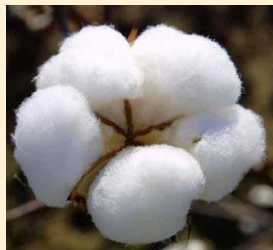
Open boll of Cotton