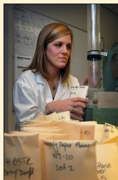
Wildflower Seed Project and Horticulture Masters student