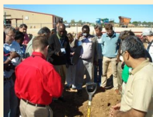
Cotton research tour