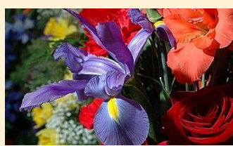
Floral Design project by our students