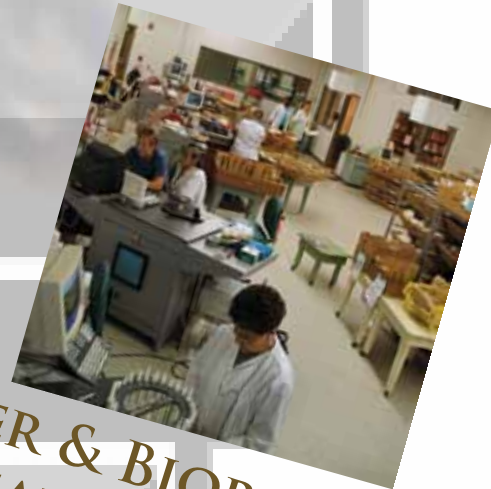
FIBER & BIOPOLYMER RESEARCH INSTITUTE