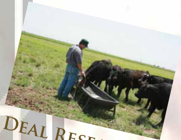
NEW DEAL RESEARCH FARM