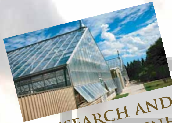
RESEARCH AND TEACHING GREENHOUSES