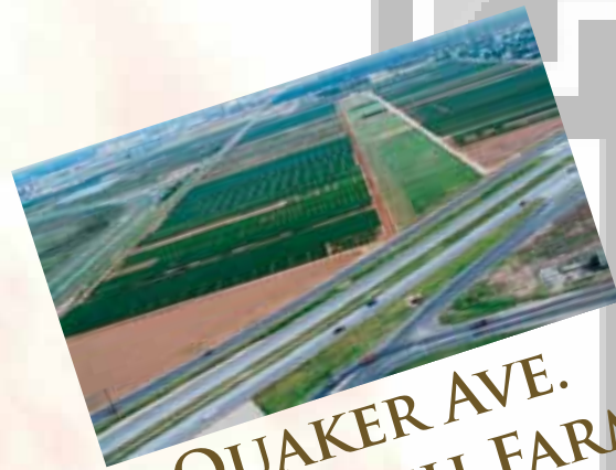
QUAKER AVE. RESEARCH FARM